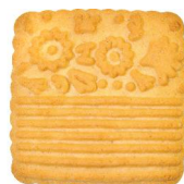
Biscuits "Lotus", vanilla flavor