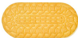
Biscuits "Sonata", vanilla flavor