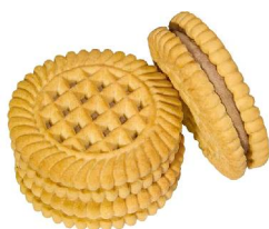
Sandwich biscuits "Mozaic" with cocoa cream