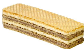
Wafers with double cream filling (cocoa & milk) "Zebra"