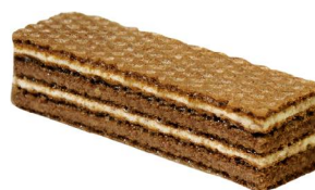
Cocoa waffle sheets with double cream filling (cocoa & milk) "Crispy"