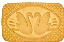
Biscuits "Swan", milk flavor