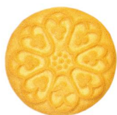
Biscuits "at Tea", vanilla flavor