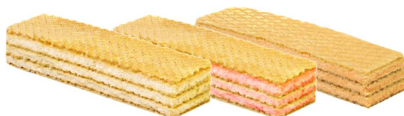
Wafers with fruit flavor (lemon/orange/strawberry)