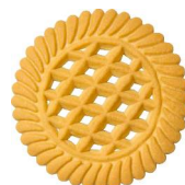
Biscuits "Mozaic", vanilla flavor