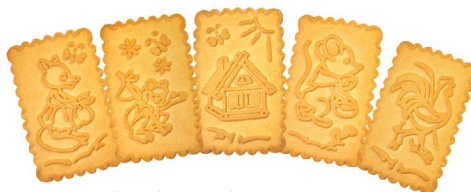
Biscuits "Fairy meadow", lemon flavor