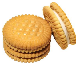
Sandwich biscuits "Mozaic" with lemon cream