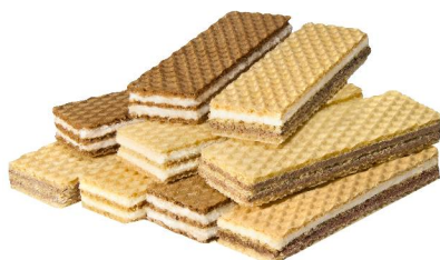
Fine wafers with cocoa/milk/ peanuts cream