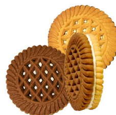
Sandwich biscuits "Zebra" with brule cream