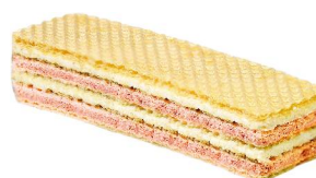
Wafers with double interlayer (milk & strawberry flavor) "Strawberry"