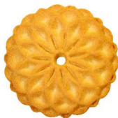
Biscuits "Day to Day", vanilla flavor