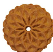
Cocoa biscuits "Africana"