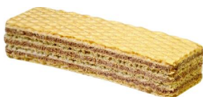
Wafers with cocoa filling Wafers with peanuts