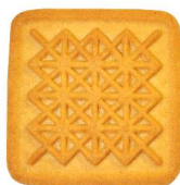
Biscuits "with Milk"