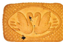
Biscuits "Swan" with raisins