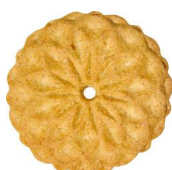
Biscuits with bran